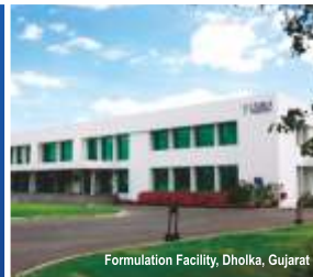
Formulation Facility, Dholka, Gujarat

Pioneer and Trend setter in Indian Branded Generic Pharma Industry