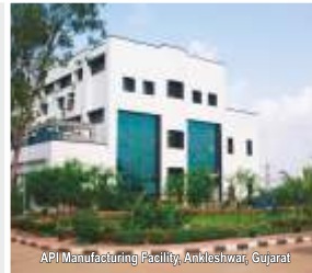
API Manufacturing Facility, Ankleshwar, Gujarat

Only Company with In-house manufacturing of Branded Generic Products