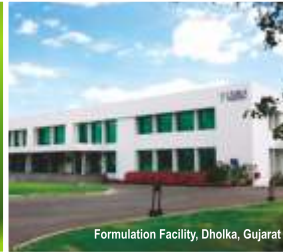
Formulation Facility, Dholka, Gujarat