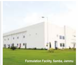
Formulation Facility, Samba, Jammu

Bulk Drugs (Active Pharmaceuticals Ingredients)