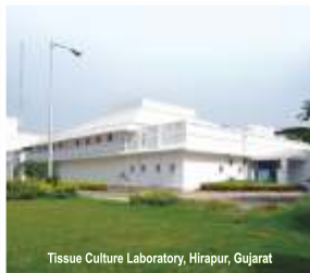
Tissue Culture Laboratory, Hirapur, Gujarat