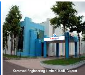
Karnavati Engineering Limited, Kadi, Gujarat