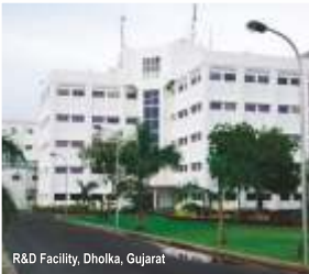
R&D Facility, Dholka, Gujarat