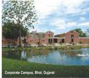
Corporate Campus, Bhat, Gujarat