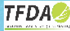
Tanzania Food & Drug Authority