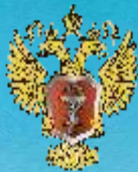
Ministry of Health of the Russian Federation